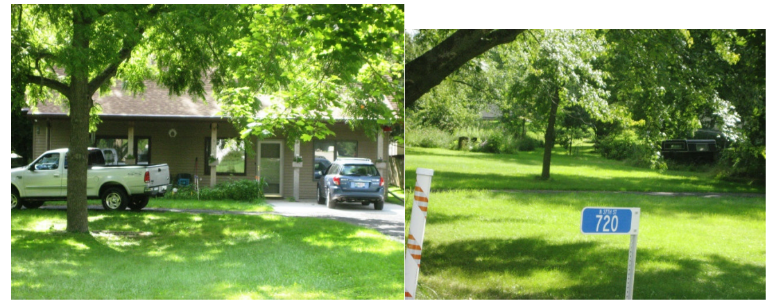
DIED IN HIS BEDROOM OF A HEART ATTACK HE HAD NOT BEEN SEEN FOR SEVERAL DAYS